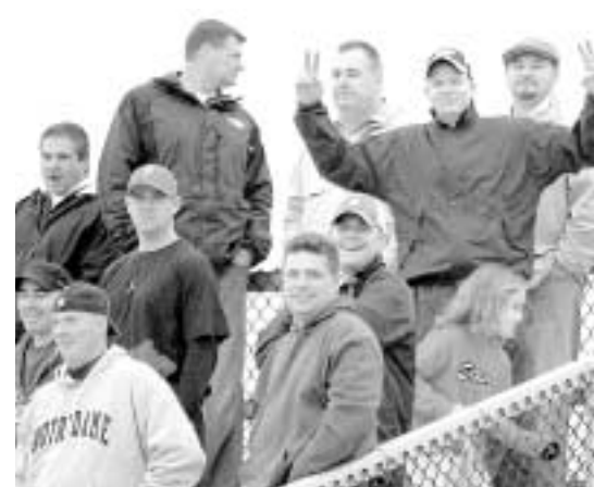
Fans in stands support Burrs at Bok Tech game