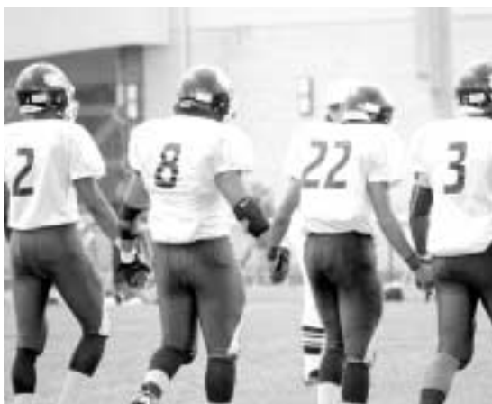
Team Captains at traditional Coin Toss