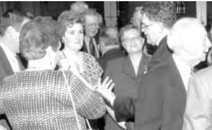
Attendees at the 2008 Sports Hall of Fame