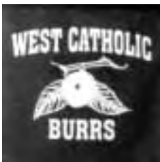
Two sided flag - Great for your shore or mountain house