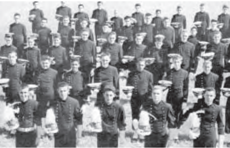
Members of the 1957 Marching Band

what an opportunity it was! The West Catholic Experience is much more than memories; it is part of our fabric that keeps us together after years removed from those four years at West Catholic that were different for each of us. Together we share and spread our spirit and pride as proud graduates of West Catholic High School. Although your physical address may be in Florida or California, you are still part of our family. Whether you attend a reunion, a West Catholic football game, Burrs at the Beach, visit the West Catholic High School of today, communicate to us during the Annual Fund, or visit our Alumni Association website you are a BURR and that is good! As we turn back the pages; please enjoy photos of some of the above mentioned activities from the 1957 yearbook.