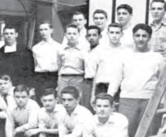
Members of the Stage Crew for the West Catholic production of "My Maryland."