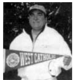
Two sided flag – Great for your shore or mountain house