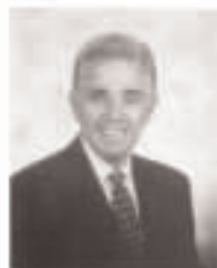
Class of '66'

548 N. Trooper Road Norristown, PA 19403