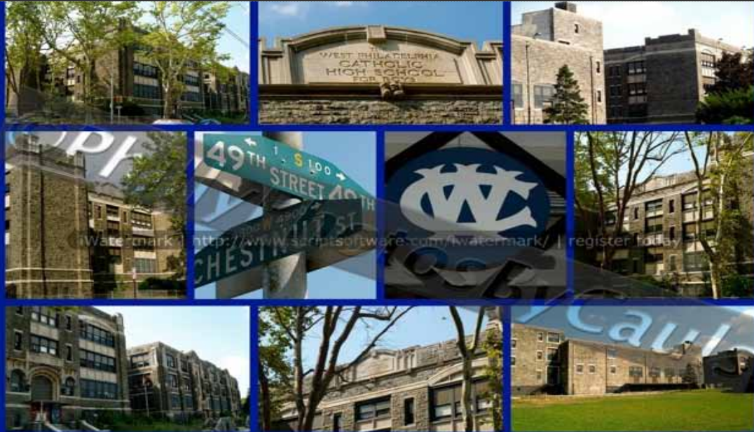
The West Philadelphia Catholic High School for Boys 1916-1989