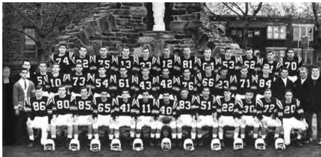
1963 West Philadelphia Catholic High School for Boys Football Team