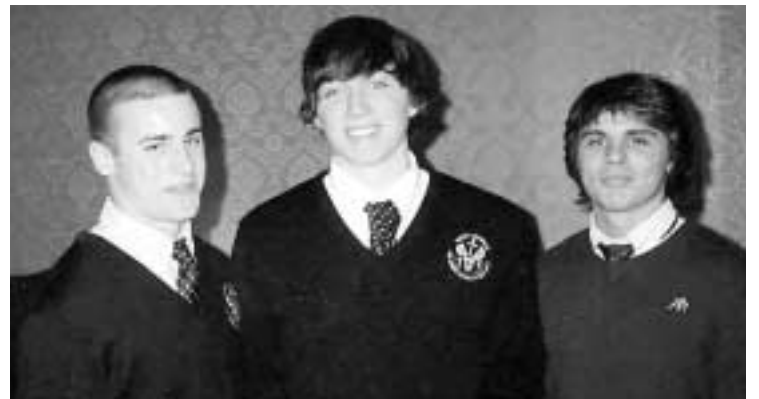
Members of the 2010 Pennsylvania AA Football Champions